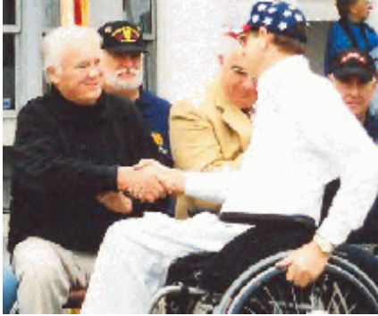
Congressman C.W. Bill Young (left) at barge dedication ceremonies

S and Key Beach Volunteers recently took part in the christening of a custom-built motorized barge dedicated to